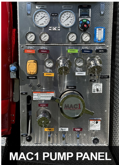
MAC1 PUMP PANEL